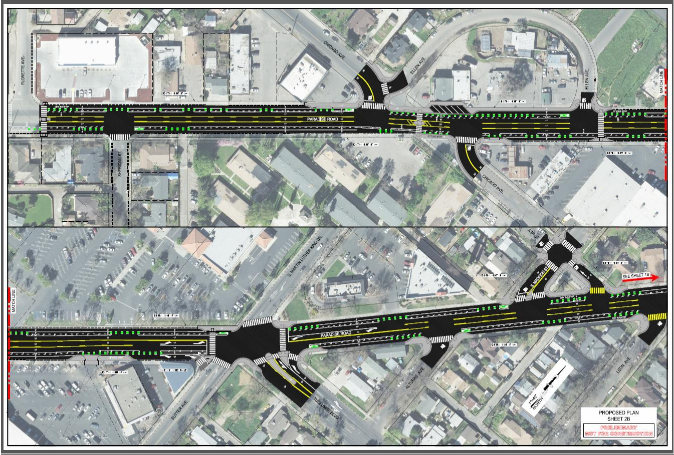
Paradise Road Project (Schematic)